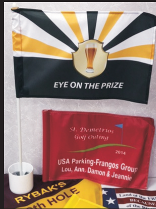
Custom Desk Displays