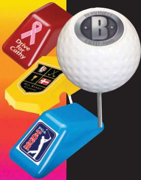
Round Tee Signs